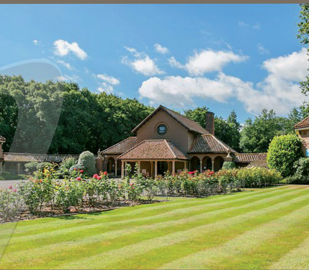
Looking forward to a blooming summer in the gardens